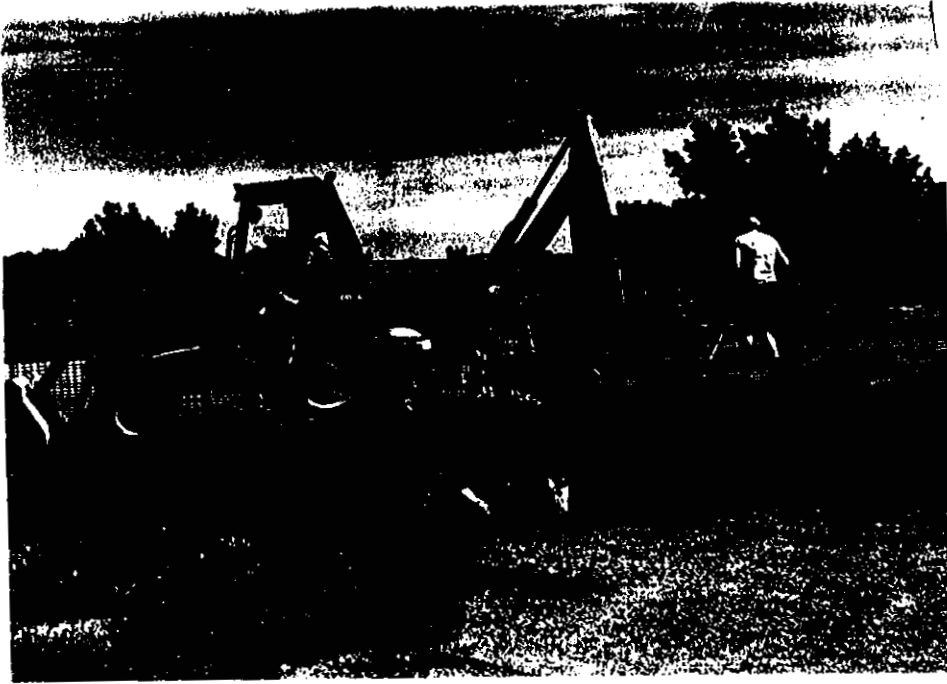
Plate 1: Backhoe exploratory excavations