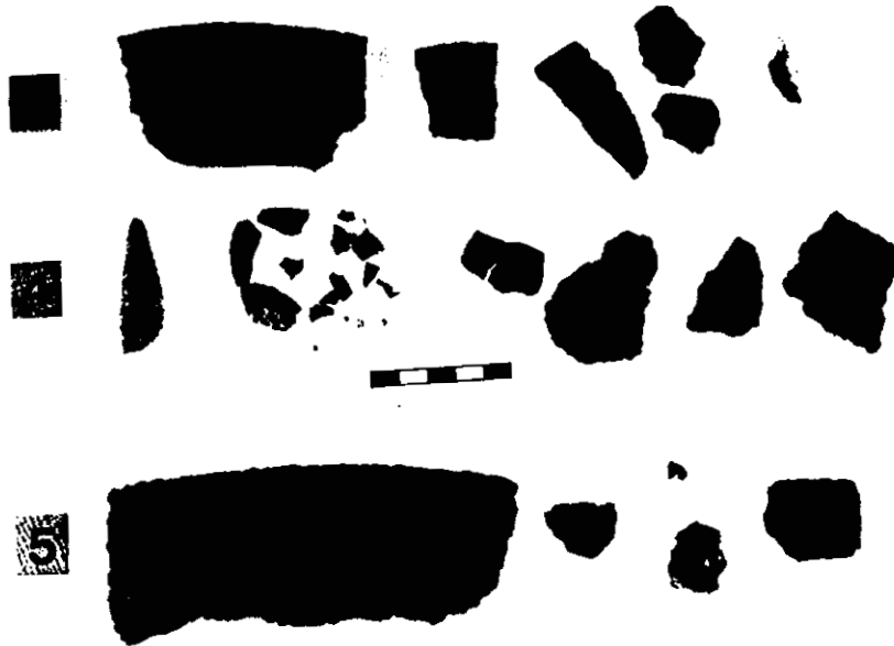
Plate 2: Artifact recoveries from Level 3 Cultural Zones