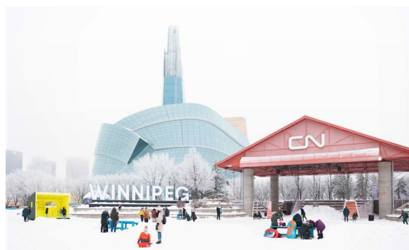
Winter programming in at CN Stage and Field