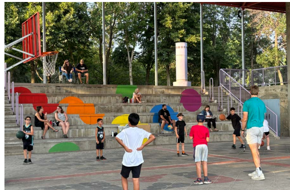
CN Stage used for Play at The Forks programming in the summer

If you are interested in booking this space, please complete the application form to receive a cost estimate. If you have questions about this space or general events at The Forks, please contact our events team at events@theforks.com .