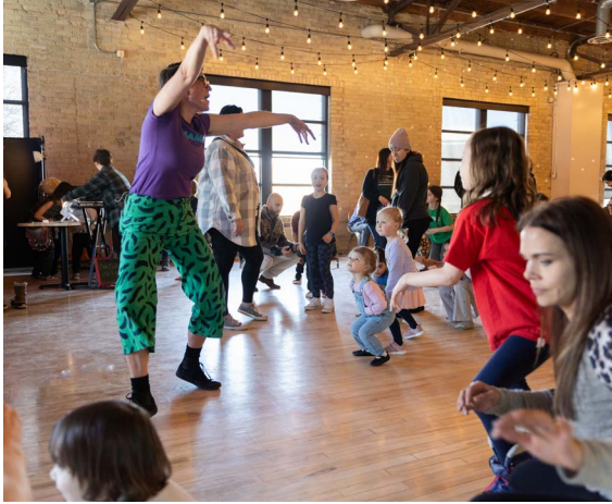
1. facing north, toward The Forks Market parking lot.