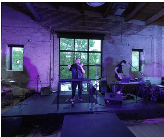
3. Entrance from The Forks Market on the east side of the room and the bay windows on the south side, overlooking The Forks Market.