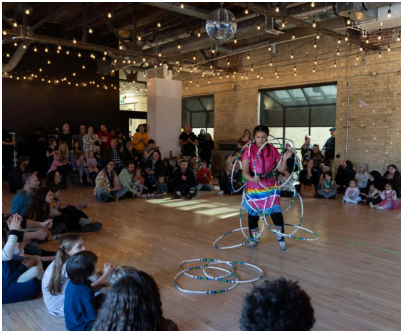
2. facing west, during a concert where the stage is being used with the canopy and rail line in the background.