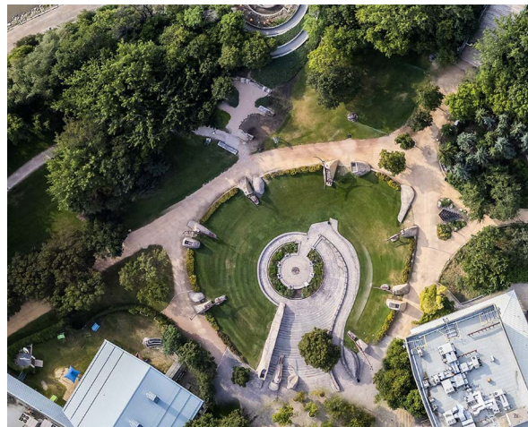
aerial view of Oodena

If you are interested in booking this space, please complete the application form to receive a cost estimate. If you have questions about this space or general events at The Forks, please contact our events team at events@theforks.com .