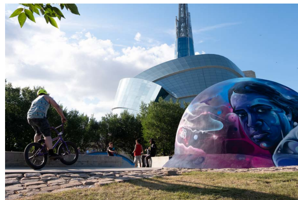
view of the painted bowl, with CMHR in the background

If you are interested in booking this space, please complete the application form to receive a cost estimate. If you have questions about this space or general events at The Forks, please contact our events team at events@theforks.com .