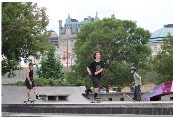
elevated areas with ledges and jump boxes