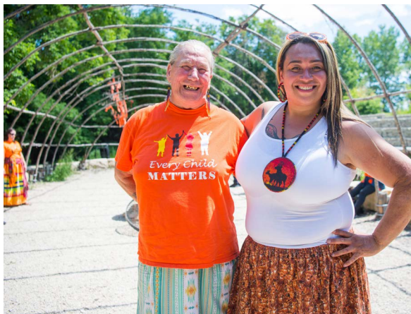
Ceremonial activities held at the Wiigiwaam during The Forks' July 1 celebrations in 2022.

This area has limited amenities due to its unique positioning, with no vehicle access, water, or power sources available. As a sacred ceremonial space, the consumption of alcohol is prohibited, and the space cannot be licensed. Additionally, the use of profanities or offensive language is not tolerated. Please note that access to Niizhoziibeegan, the Wiigiwaam, and the Gathering Space is currently limited to the active transportation path located on Main Street, due to the current closure of the Historic Railbridge.