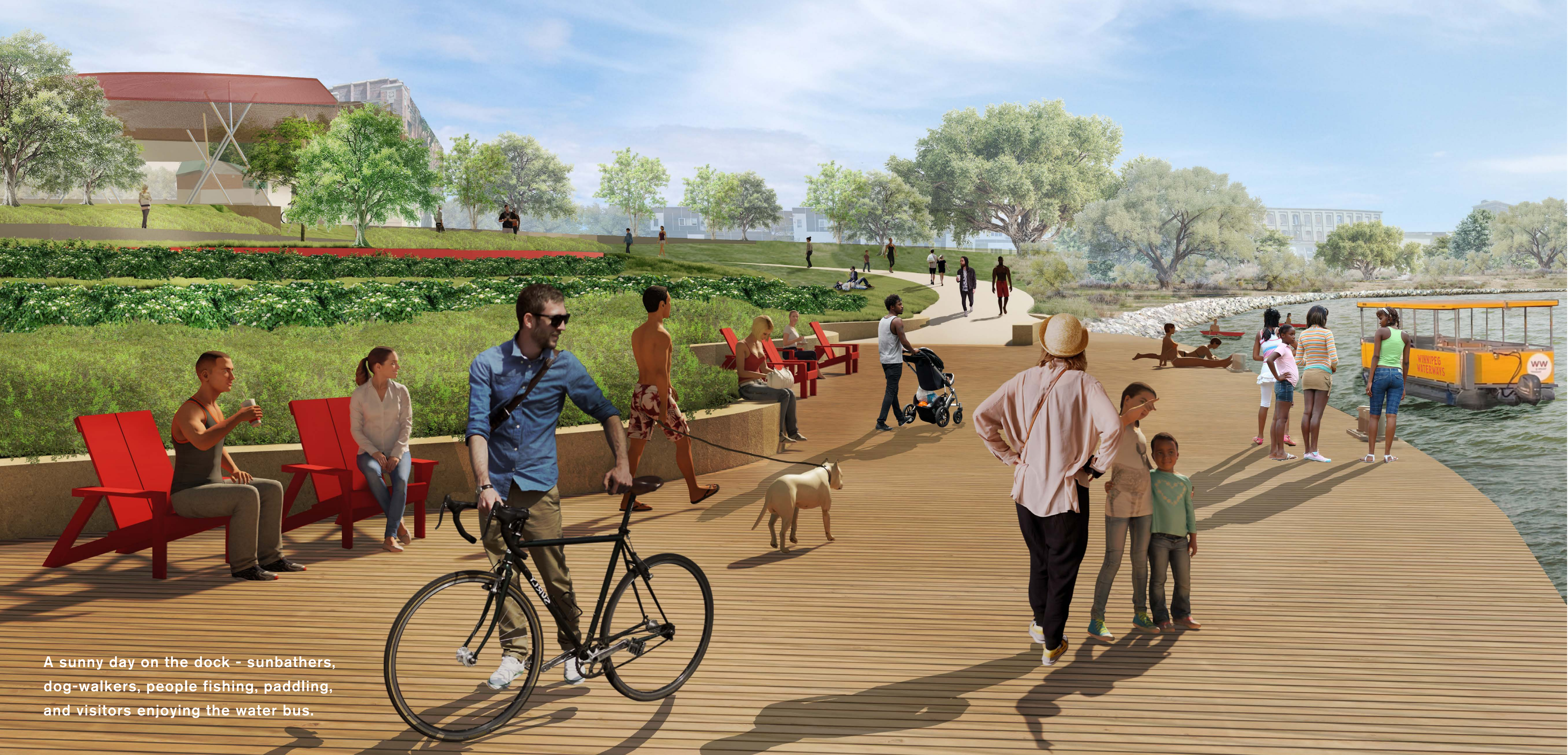
A sunny day on the dock - sunbathers, dog-walkers, people fishing, paddling, and visitors enjoying the water bus.

At the Upper Wave Deck, lighting is incorporated through a raised catenary system and within benches. The Arbour at the Gathering Circle has integrated lighting within the overhead structure. Pole lights are used in the mid-riverbank while North and South gateways will be marked with indirect lighting. Seasonal lighting is incorporated with programming on the dock.