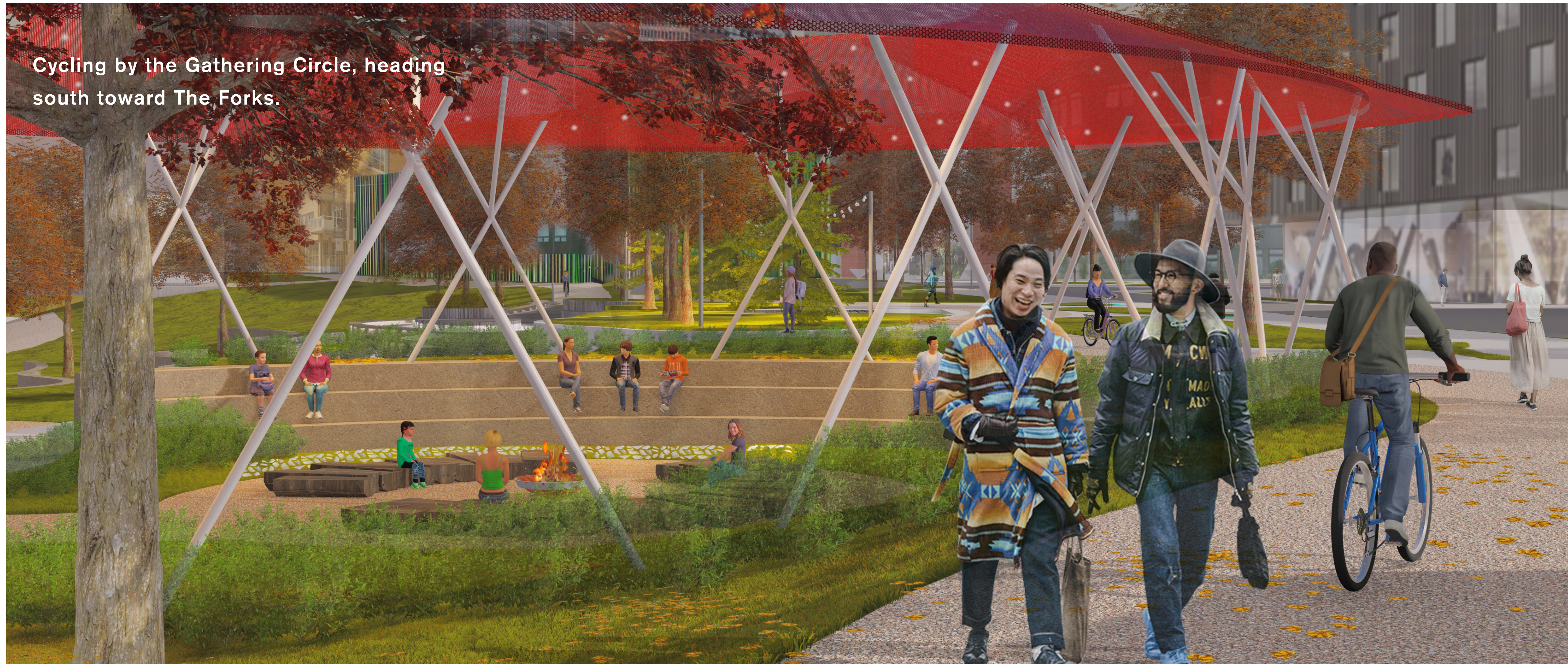
Cycling by the Gathering Circle, heading south toward The Forks.